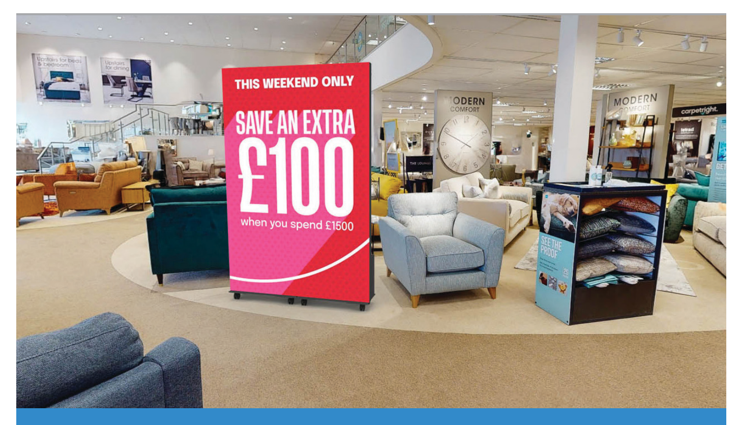
Maximize visibility, flexibility, and engagement with our all-in-one DV-LED totem solution